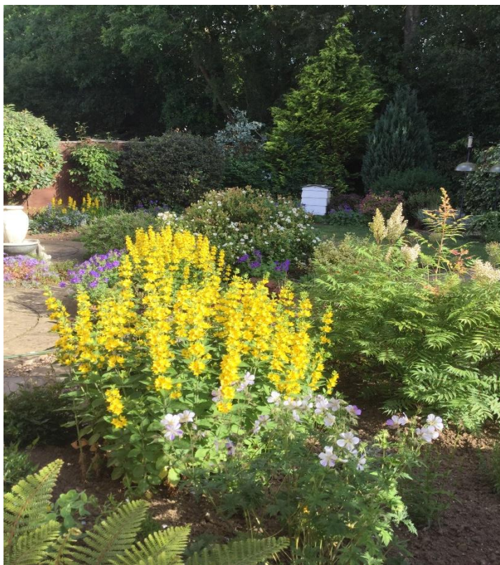
Garden view from Andy Coles