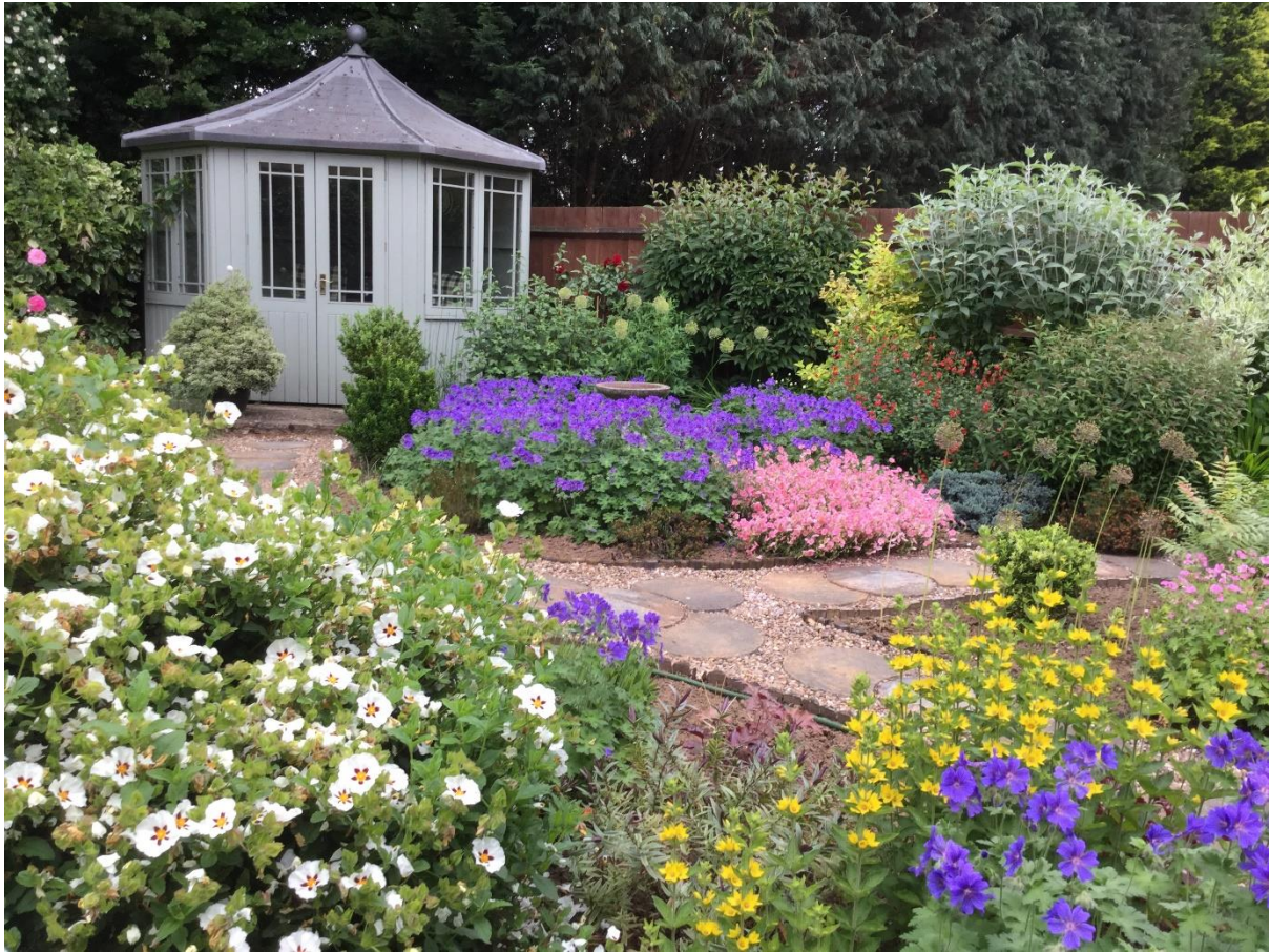
Andy Coles garden

When trying to hold small grandchildren still while tying their shoelaces I wish I had found this site.